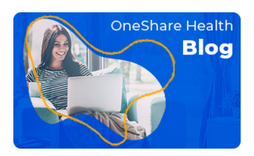
Read the latest articles from the One Share, One Voice Blog by subscribing today!